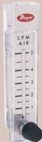
Model RMA-SSV 2" scale, 4-13/16" high