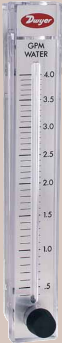
Model RMC-SSV 10" scale, 15-3/8" high