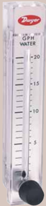
Model RMB-SSV 5" scale, 8-3/4" high