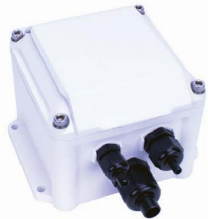
Protective Cover Closed