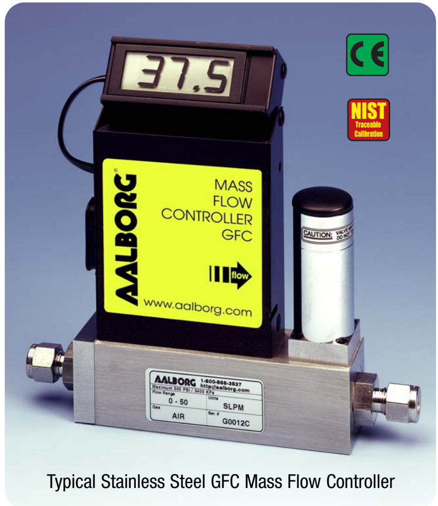
Typical Stainless Steel GFC Mass Flow Controller

Compact, self-contained GFC mass flow controllers are designed to indicate and control flow rates of gases. The rugged design coupled with instrumentation grade accuracy provides versatile and economical means of flow control. Aluminum or stainless steel models with readout options of either engineering units (standard) or 0 to 100 percent displays are available. The built-in electromagnetic valve allows the flow to be set to any desired flow rate within the range of the particular model.